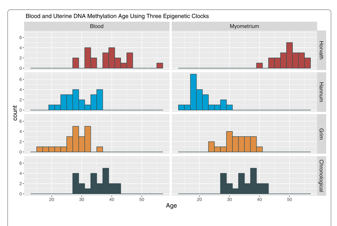
Fig. 1 Blood and myometrial DNA methylation using three epigenetic clocks. The distribution of epigenetic age for each clock (labeled on right hand side of graph) by tissue is presented with the distribution of chronological age of the sample for reference